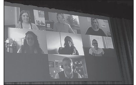
Services Organization of the Year: Sheboygan County Division of Public Health Sponsor: Prairie States Enterprises, Inc.