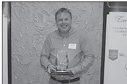
Resilient Business of the Year: Parm's Landscape Management, Inc. Sponsor: CLA (CliftonLarsonAllen, LLP)