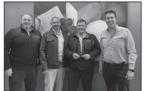
Safety Leader of the Year: Masters Gallery Foods Sponsor: Wisconsin Lakeshore Safety Council