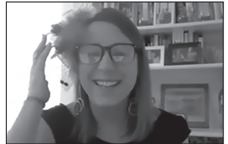
Working Together: Sheboygan County COVID-19 Relief Fund (United Way of Sheboygan County/Sheboygan Service Club) Sponsor: Prevea Health