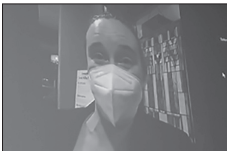
Culinary Star of the Year: The Blind Horse Restaurant & Winery Sponsor: Sheboygan County Chamber of Commerce