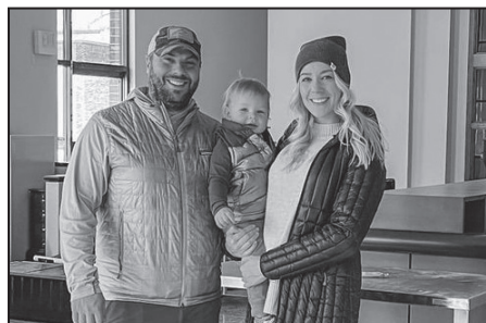
Retailer of the Year: Aventuron Sponsor: Sheboygan County Chamber of Commerce