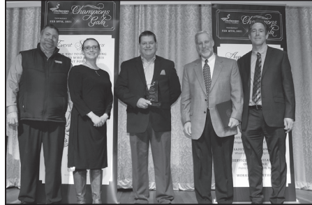
Manufacturer of the Year: Old Wisconsin Sausage Company Sponsor: Sheboygan County Chamber of Commerce